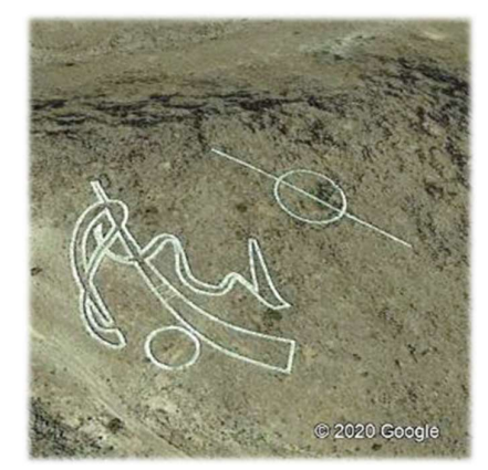
Some land art is so big, it can be seen from space! Andrew Rodger's Rhythms of Life project covers 18 sites around the world.

Land art, or environmental art, uses materials 'of the Earth' – the soil, water, stones and vegetation found on-site. Often the art only lasts a short while before the materials used merge back into the landscape.