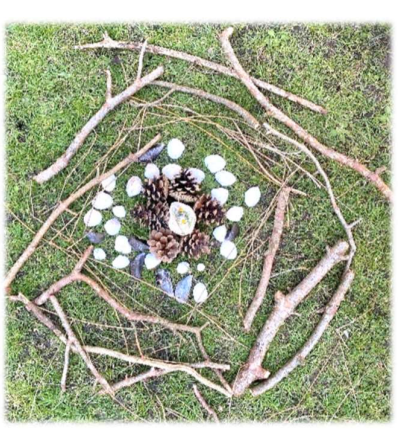
You can make your own land art using any materials available to you in your garden or your home. For example, outside you could look for cones, twigs, leaves or daisies.