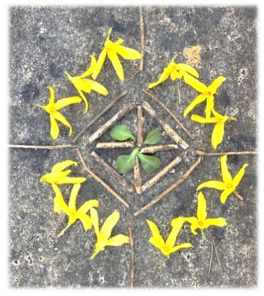
Other pieces are really tiny and can simply blow away in the breeze.