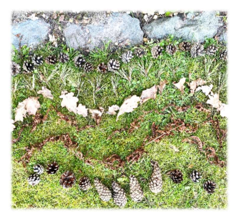
Land art can be any shape – one you think of yourself, or something that follows the natural contours of your location.