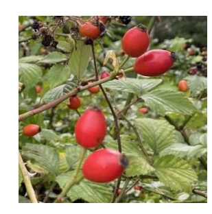
Dog Rose Hips